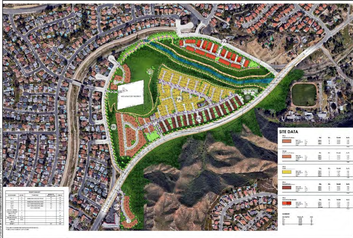
FIGURE 2-1 PROPOSED DEVELOPMENT PLAN